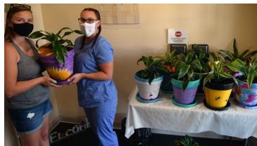
An adult advisor delivers youth-decorated potted plants to an assisted living facility following a virtual leadership and community service experience.

See the Club Corner for ideas of service projects your club can do.